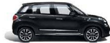
609 Heavy Metal Grey ☐ white roof