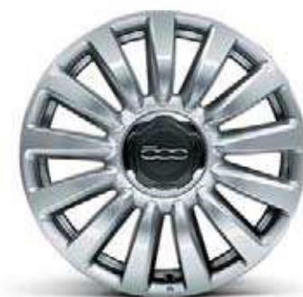
433 16" SILVER ALLOY WHEELS