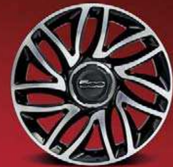
17" ALLOY WHEELS WITH BLACK DIAMOND FINISH