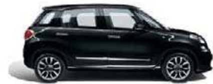
601 Darkwave Black ☐ white roof