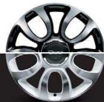
5FB 17" ALLOY WHEELS WITH WHITE DIAMOND FINISH