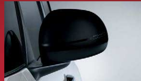
CERAMIC EFFECT BLACK MIRROR COVER