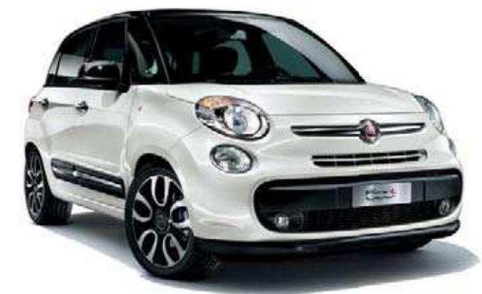
MODEL SHOWN IS FITTED WITH OPTIONAL EQUIPMENT

THE FIAT 500L ALLOWS YOU TO CONNECT WITH ALL THE IMPORTANT PEOPLE IN YOUR LIFE, WHILST ON THE MOVE