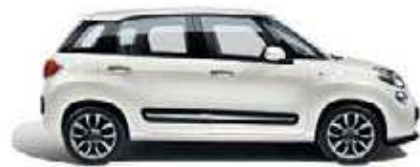
268 Bossa Nova White ■ black roof