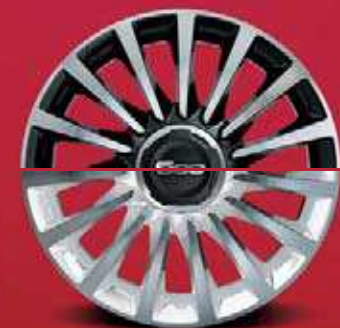
6Y8 17" ALLOY WHEELS WITH WHITE DIAMOND FINISH