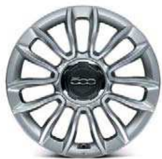
439 16" SILVER ALLOY WHEELS