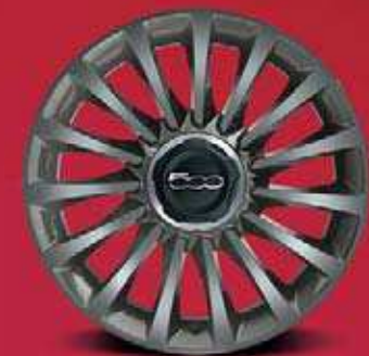
6U4 17" SILVER ALLOY WHEELS