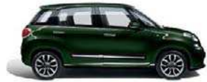
390 Beatbox Green ☐ white roof