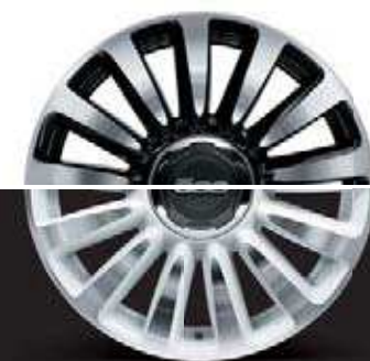
4WQ 16" ALLOY WHEELS WITH WHITE DIAMOND FINISH