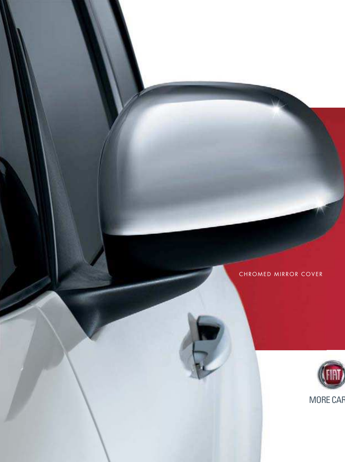
CHROMED MIRROR COVER