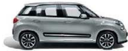
612 Minimal Grey ■ black roof