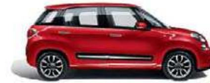
111 Pasodoble Red ☐ white roof ■ black roof