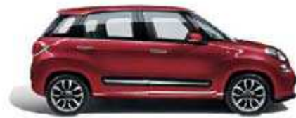
108 Opera Red ☐ white roof ■ black roof