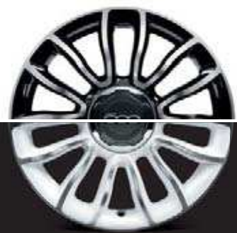
55E 16" ALLOY WHEELS WITH WHITE DIAMOND FINISH