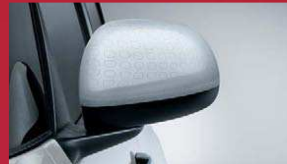
TECHNICS EFFECT WHITE MIRROR COVER