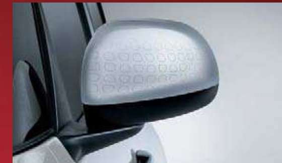
TECHNICS OUTLINE EFFECT ALUMINIUM MIRROR COVER