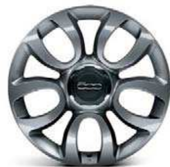
435 17" DARK GREY ALLOY WHEELS