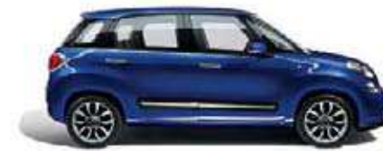
530 Backbeat Blue ☐ white roof ■ black roof