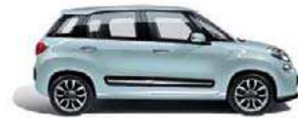
483 Bashment Blue ☐ white roof ■ black roof