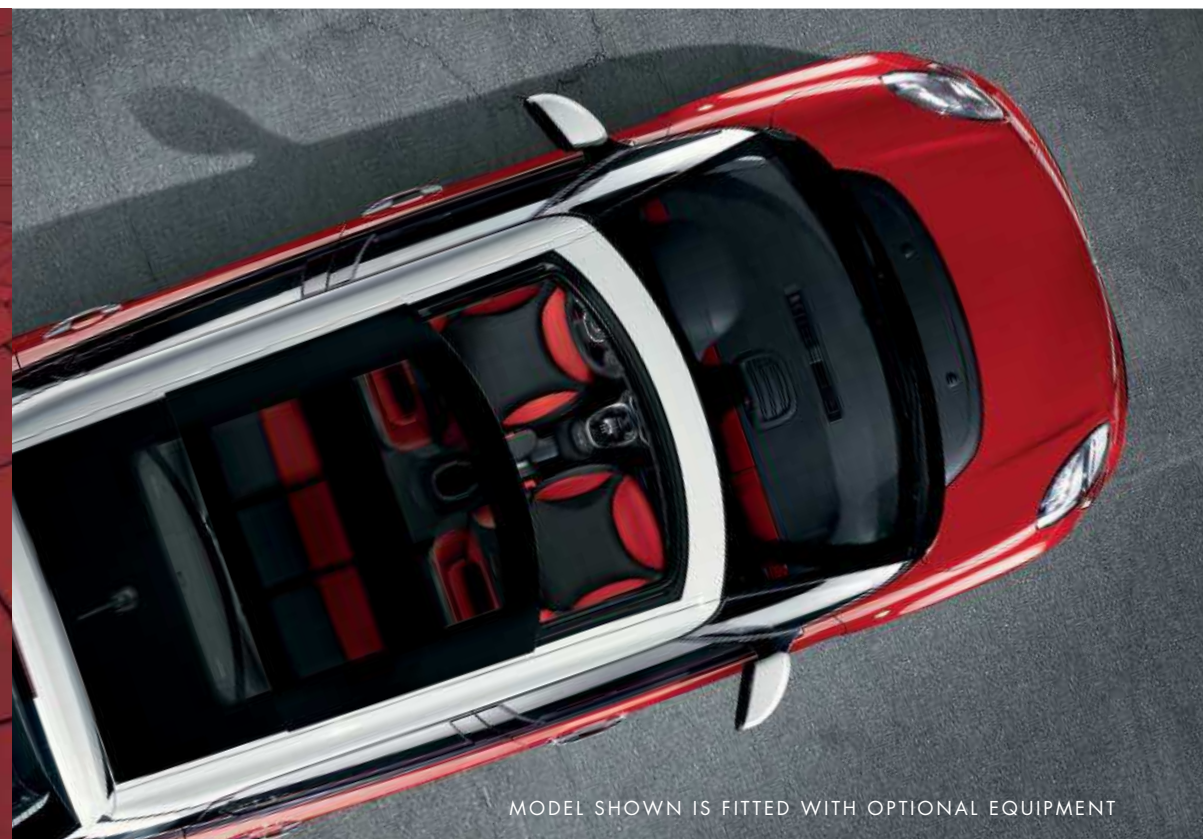
MODEL SHOWN IS FITTED WITH OPTIONAL EQUIPMENT

BRIGHT AND SUNNY, THE FIAT 500L IS A WINDOW OUT TO THE WORLD THANKS TO THE RIBBON WINDOWS AND LARGE PANORAMIC SUNROOF* BOASTING A SURFACE AREA OF A GENEROUS 1.5 M 2 , THE LARGEST IN ITS CATEGORY, AVAILABLE BOTH IN A FIXED OR ELECTRONICALLY-OPERATED SKYDOME VERSION.