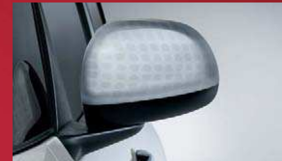
TECHNICS SILVER EFFECT ALUMINIUM MIRROR COVER