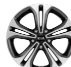
17" Alloy Wheels with Graphite Finish