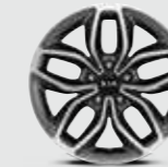
18" Alloy Wheels with Graphite Finish