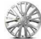
15" Steel Wheels