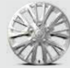
15" Steel Wheels