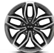
18" Alloy Wheels with Graphite Finish